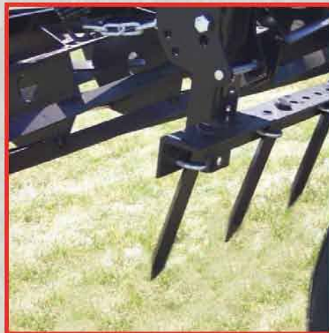
Straight Spike Tooth

The cart is available in sizes from 11'9" through 40'9" with 12', 14' and 16' base sizes. Telescoping front hitch standard. Red or green color options are available to match your tractor color.