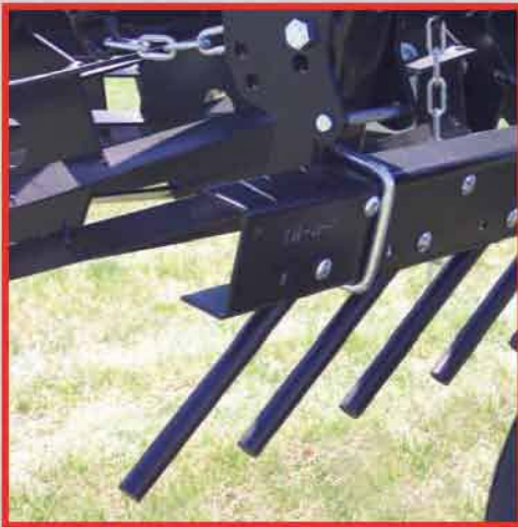
Angled Spike Tooth