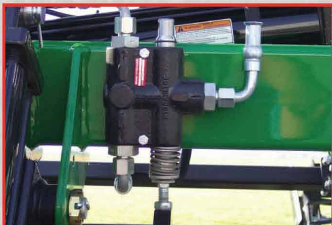
Hydraulic by-pass for quick turns standard

Roller assemblies can be set to aggressive mode to penetrate the soil or passive mode to break clods and help firm and level soil on top.