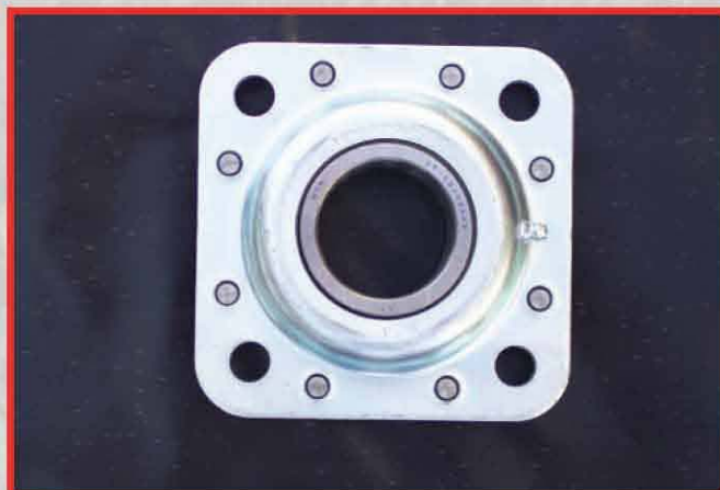
Heavy duty 1-1/4" flanged disk bearings standard