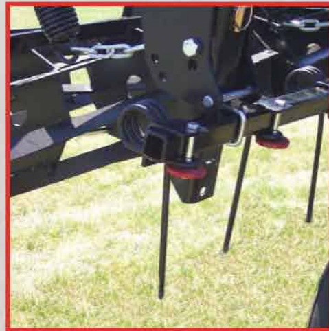
Spring Tine Harrow