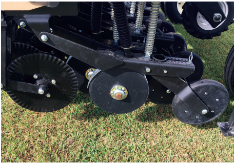
Heavy duty double disk, staggered mounting (6"), Quick T handle depth adjustment, 2 x 13 press wheels.