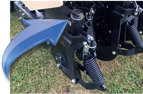
Pull this pin on each row to remove no-till coulters assembly. This converts drill from no-till to conventional.