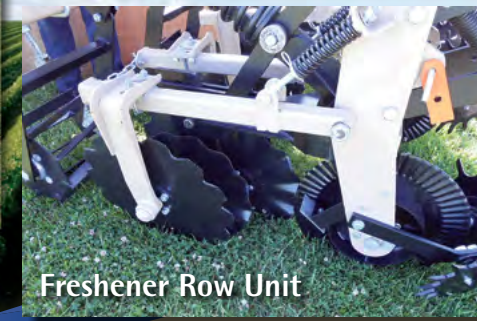
Freshener Row Unit