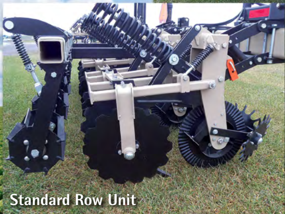
Standard Row Unit