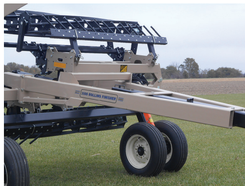
Heavy Duty Front Hitch