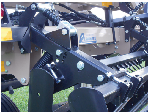
Double Spring Down Pressure