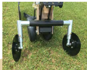
Barring Off Disks